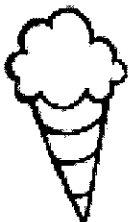
ice cream cone